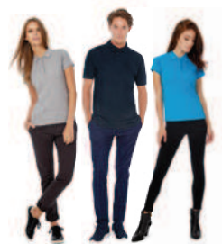
B&C Safran, B&C Safran Pure /women & B&C Safran Timeless /w.